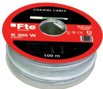
K 300 W